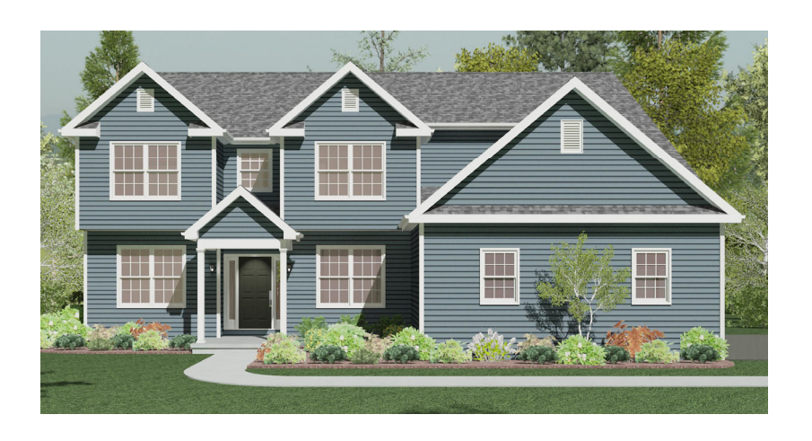
2,512 Square Feet