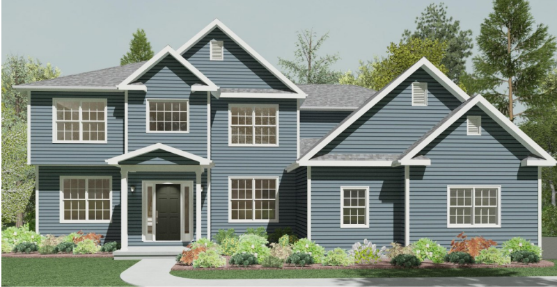
2,962 Square Feet